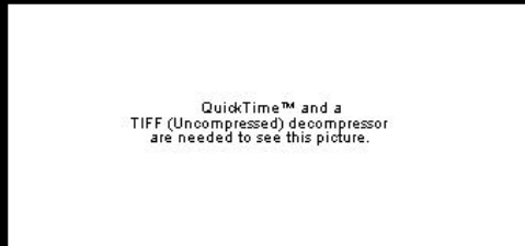
Satellite (TRMM 3B42)